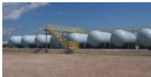
Frother Storage at FloMin

FloMin has developed proprietary blends that have demonstrated excellent improvement in frothing capabilities and which are readily available. FloMin technicians are trained to develop and formulate the optimal frother for your flotation.