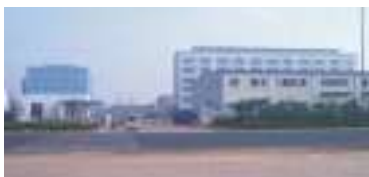
FloMin Xanthate Plant in Qingdao, China